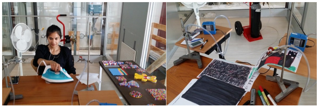
FIGURE 6.1. COLLECTION DURING ACTIVE USE OF PLASTIC BEADS (LEFT) AND MARKERS (RIGHT)