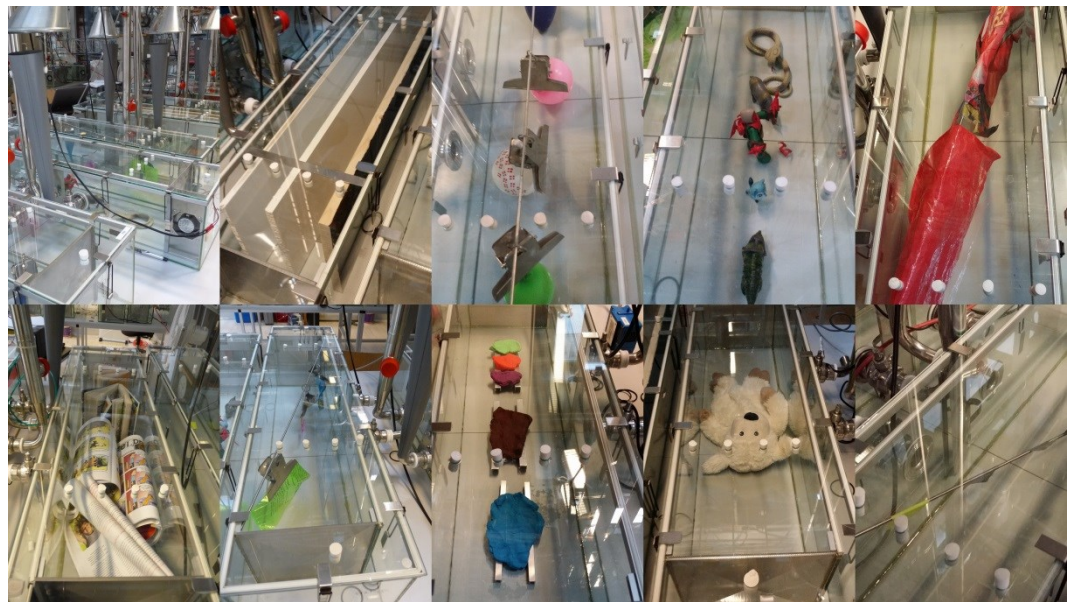
FIGURE 6.3. SETUP IN CLIMPAQ CHAMBERS. FROM THE LEFT, TOP: CLIMPAQ CHAMBERS AT SBI, WALL AND WOOD PAINT USED ON GIPSUMBOARD AND WOODEN BOARD, BALLOONS, RUBBER FIGURES, PLAY TENT, DOWN: COMICS, RUBBER BEACH-ARTICLES, MODELLING CLAY, TEDDY BEAR, TAPE

For modelling clay, the air change rate in CLIMPAQ was set to 0.5 h<sup>-1</sup> with three small packets of modelling clay. This high load was chosen to measure the potential exposure in the breathing zone of a child playing with modelling clay. For a teddy bear with lavender fragrance for heating in a microwave oven, the air change rate was close to 0 h<sup>-1</sup> with one teddy bear to simulate exposure of the sleeping child with the teddy bear close to child's face. In the two scenarios, an extra air sample was collected immediately after setup. The temperature during emission measurements in CLIMPAQ was 23 ±0.7 °C and the relative humidity was 51 ±4 % RH.