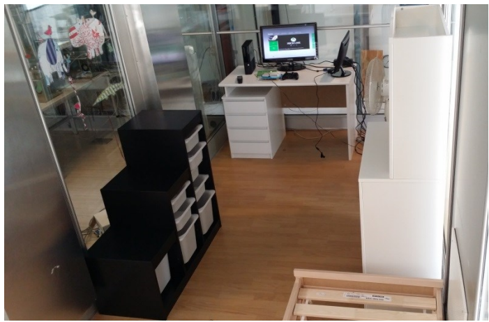
FIGURE 6.2. MOCK-UP OF A CHILDREN'S ROOM

A full scale mock-up of a children's room was set up to measure the total emission from relevant children's room furniture, building materials and electronics. The entire floor area in the full scale climate chamber was covered with new laminate flooring. The mock-up room was equipped with a bed, a desk and two kinds of closets/shelf combinations. Self-adhesive decorative foil was pasted on a wall and self-adhesive shelf paper on another wall. The room was also equipped with a new computer monitor, laptop charger/power supply, play station and an older television (proved necessary as the play station did not work without a television and a new one was not purchased) (Figure 6.2).